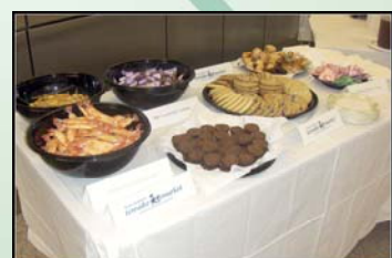
Thank you to Tensuke Market for the very generous donation of snacks and items for the Speech Contest.