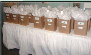
All participants received a JASCO t-shirt, snacks from Tensuke Market, and posters from The Japan Foundation and Japan National Tourist Organization