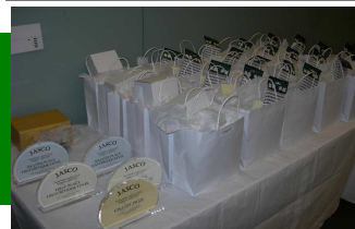
The prizes for first through third place winners!