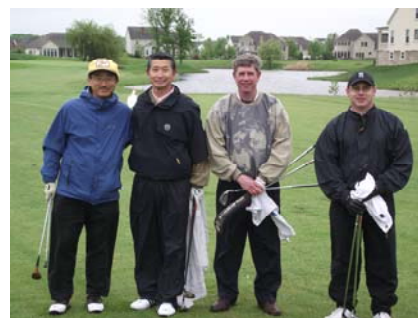
Pictured: Team Hidaka USA takes the Second place team award with

We also raised $500 for Japan Earthquake & Tsunami Relief.